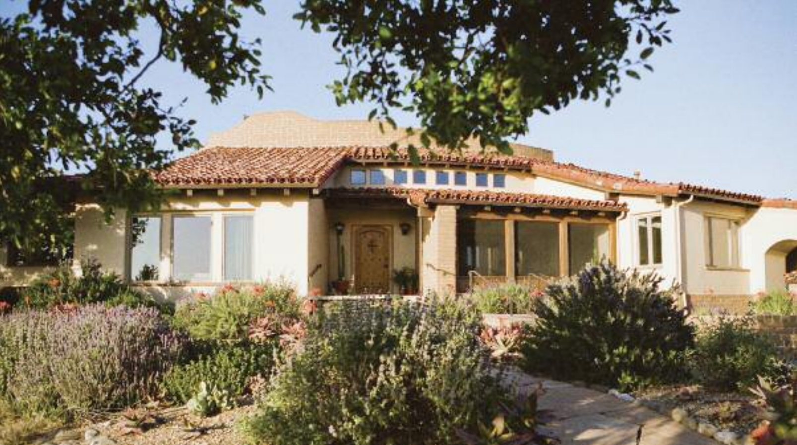
Above: Rancho Zorra's entrance provides exterior clues to its interior design: clerestory windows that illuminate the entranceway; a screened porch to the right for enjoying evening sunsets and the adobe wall that dramatically projects above the roofline.