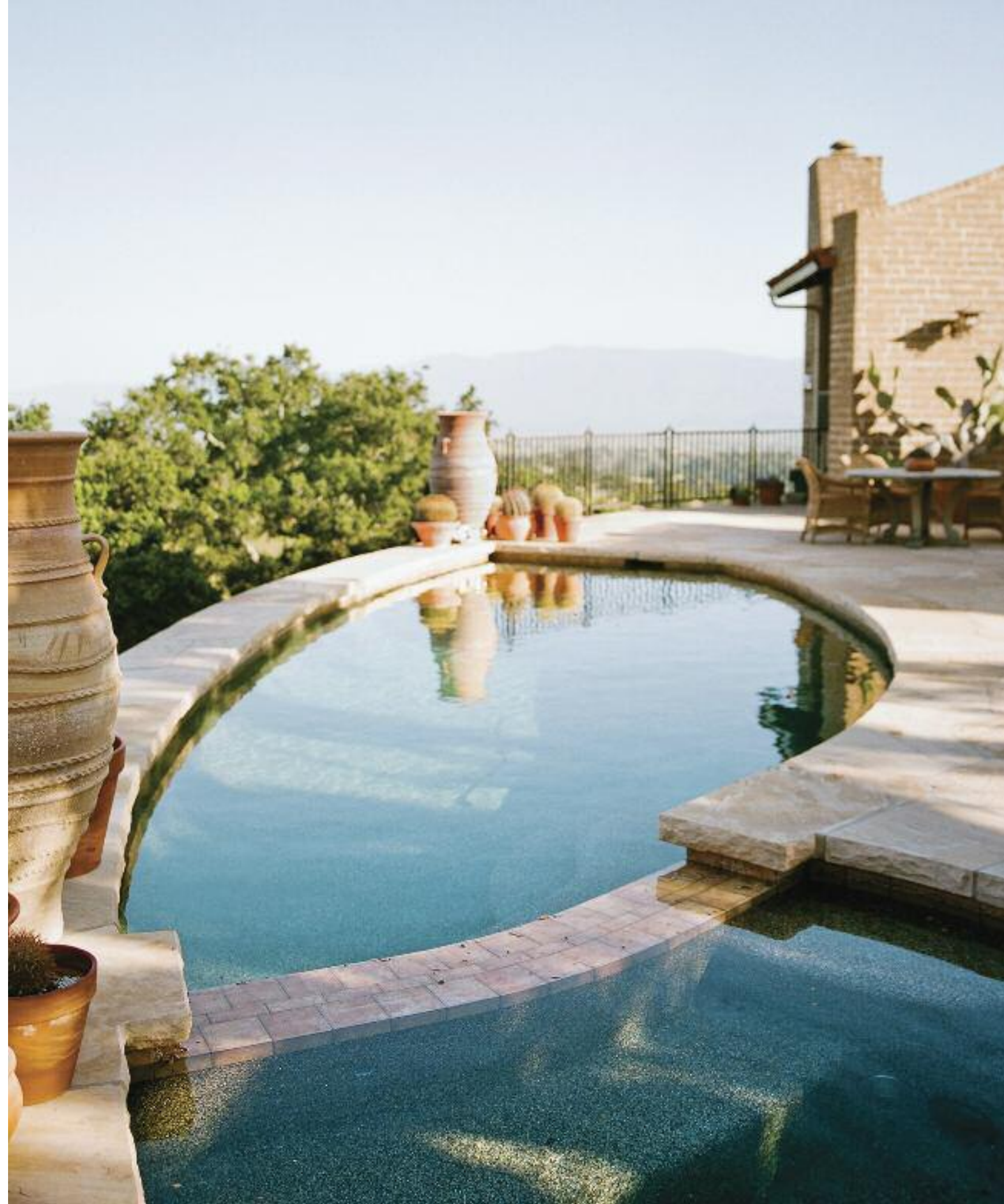
Opposite right: Swimming in this pool offers the added enjoyment of a stunning view all the way to Sedgwick Reserve. Above: The living room faces towards a mountain view and serves as both a library and a showcase for Susan's photographs of Africa.